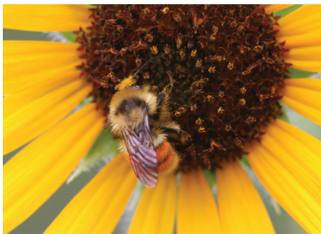
Figure 12: A small, midsummer bumble bee worker.