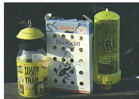
Figure 7: Yellowjacket traps.

The majority of bees in the honey bee colony are workers – females that are infertile solely because their diet during development was insufficient for them to mature into a fertile queen. All of the bees – workers, the queen, and the few males