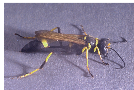
Figure 8: Mud dauber.