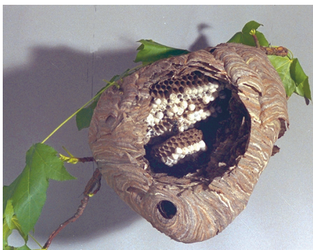
Figure 4: Baldfaced hornet nest cutaway to expose paper comb.