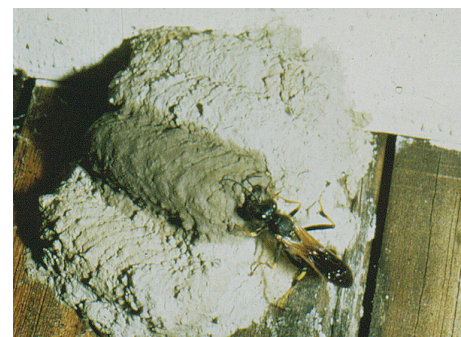
Figure 9: Mud dauber building nest.