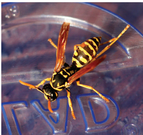
Figure 6: European paper wasp.

and inconspicuous. Colonies are readily defended and yellowjackets will sting when the nest area is disturbed.