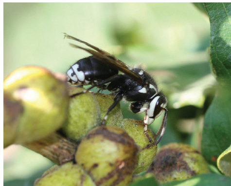
Figure 2: Baldfaced hornet.

nectar, however, social wasps are generally not important plant pollinators.