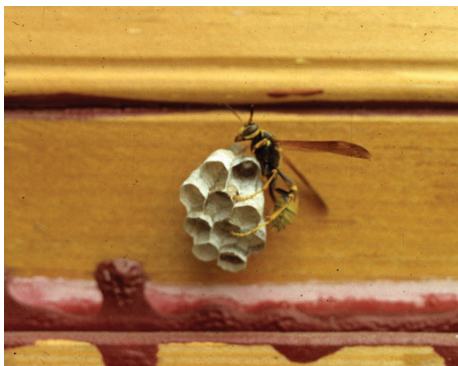
Figure 5: The western paper wasp, a native species of paper wasp.