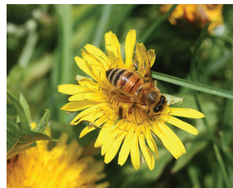
Figure 10: The honey bee is an important and beneficial insect due to its production of honey and other products, as well as pollination of plants.