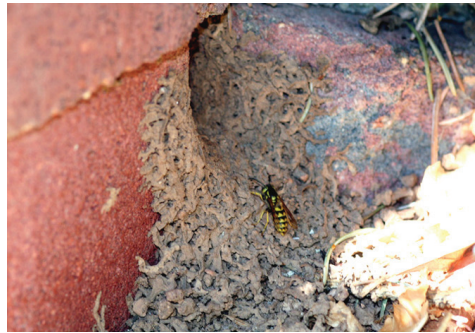
Figure 1: Yellowjacket entering nest underneath wall.

Most social wasps rear their young on a diet of live insects. Several types of social wasps are important in controlling insect pests such as caterpillars. An exception to this is the western yellowjacket, which primarily scavenges dead insects, earthworms and other carrion, including garbage. This scavenging habit is usually why yellowjackets become serious nuisance problems. Male wasps occasionally visit flowers to feed on