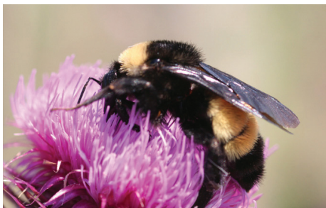
Figure 11: Bumble bee queen.