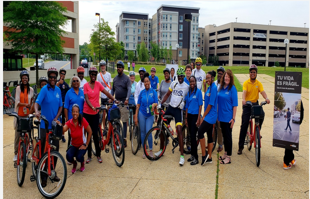
(Bike and Walk Convoy gathered just outside the Largo Metro Station)