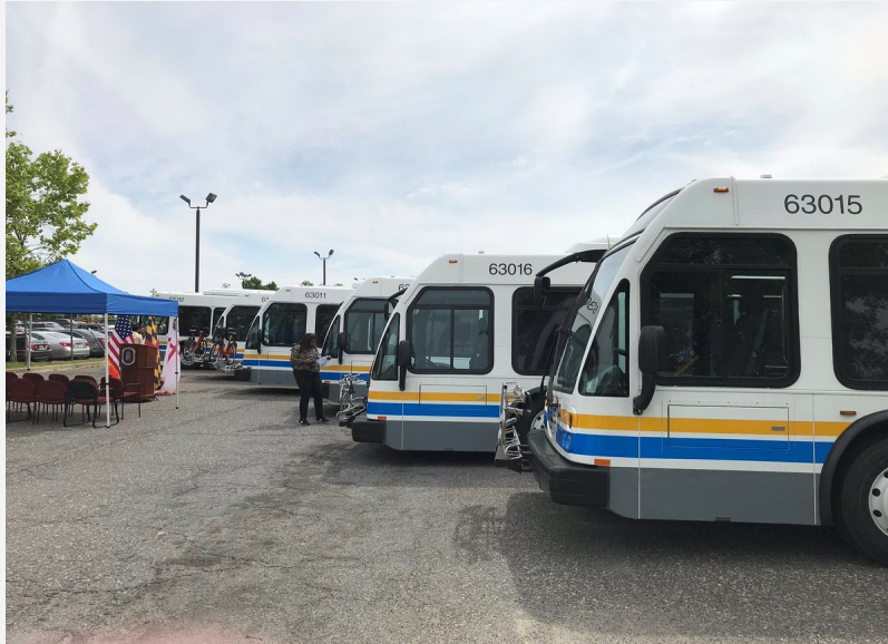
Six New Buses