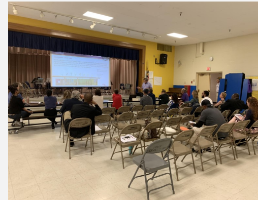
(DPW&T attended the Purple Line University Blvd. CAT meeting held on May 29, 2019)

The Prince George's County Department of Public Works and Transportation (DPW&T) held a successful Public Information Meeting on June 13, 2019 regarding proposed improvements along Metzerott Road, beginning at MD 650 (New Hampshire Avenue) and extending eastward to Adelphi Road. Individuals throughout the community took part to learn more about the project and how the roadway improvements, along with the installation of pedestrian and bicyclist facilities, will greatly enhance safety for all users.