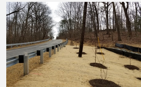
Bryan Point After Downstream Side Slope