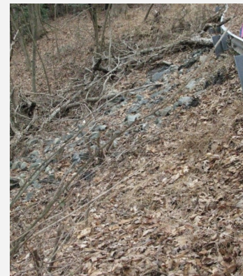
Bryan Point Before Downstream Side Slope