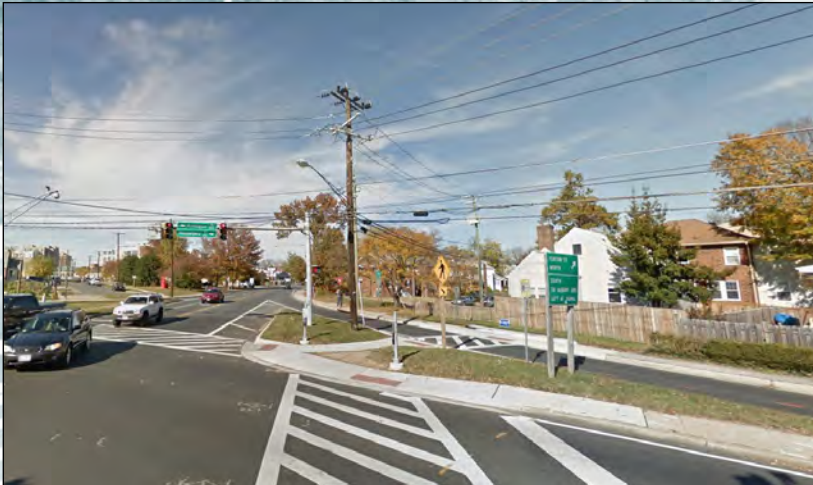
Top: Looking north on Fenton Street at MD 410.

Public input is the key to an effective planning process as it allows MCDOT and Montgomery County decision makers to understand the needs of the community.