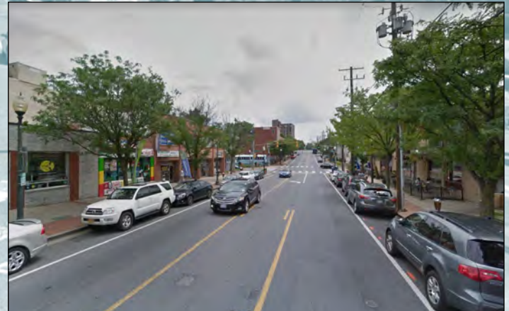
Right: Looking south on Fenton Street at Silver Spring Ave.

Title VI: Montgomery County assures that no person shall, on the grounds of race, color, or national origin, as provided by Title VI of the Civil Rights Act of 1964 and the Civil Rights Act of 1987, be excluded from the participation in, be denied the benefits of, or be otherwise subjected to discrimination under any program or activity.