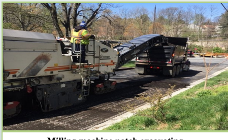
Milling machine patch excavating

Crews will excavate the distressed pavement will be posted to notify residents of the with a pavement milling machine or excavator.