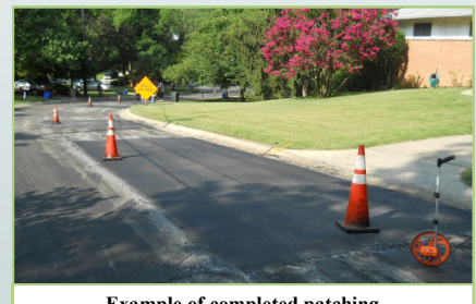
Example of completed patching

1. Conduct survey - Identify areas of roadway in need of repair prior to resurfacing. You may notice paint markings that outline areas for pavement replacement, such as those shown in the picture to the left.