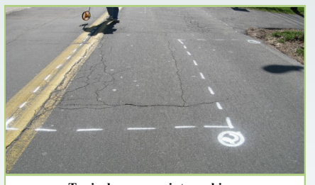
Typical survey paint markings

Most notably, crack seals, asphalt patching, micro resurfacing, and hot mix asphalt overlays are chief among pavement restoration options. MCDOT is now developing Countywide maintenance strategies based on the countywide pavement assessment which uses both an objective rating system and budgetary parameters.