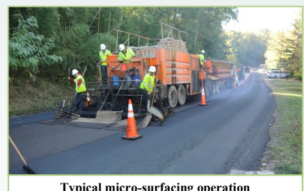
Typical micro-surfacing operation

Street repair, preparation and resurfacing work is generally characterized by some noise and dust. However, MCDOT will do its best to keep the site in good housekeeping