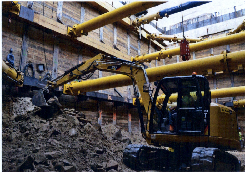
January 2019: 40 ft deep