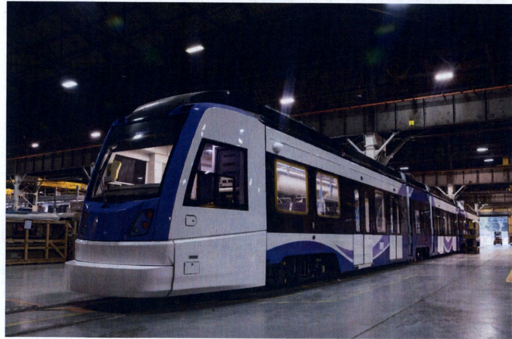
September 2019: 22 out of 130 modules shop assembled

June 2019: Began shop testing of 1 st completed train