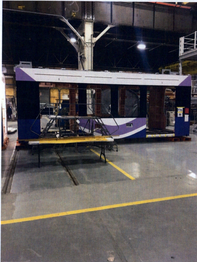
January 2019: 5 modules assembled in Elmira, NY